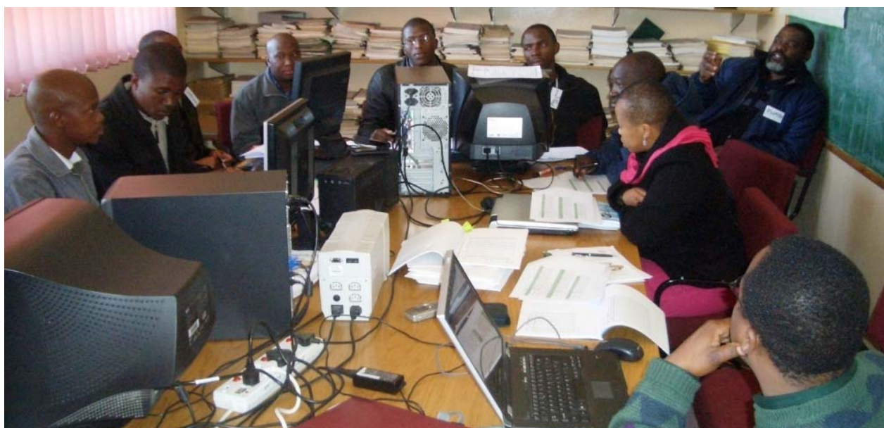
Figure 2: LIMS template and application training in Lesotho in progress

The LIMS training had two major components. These are the training on the LIMS template and the training on the operation and use of the LIMS application.