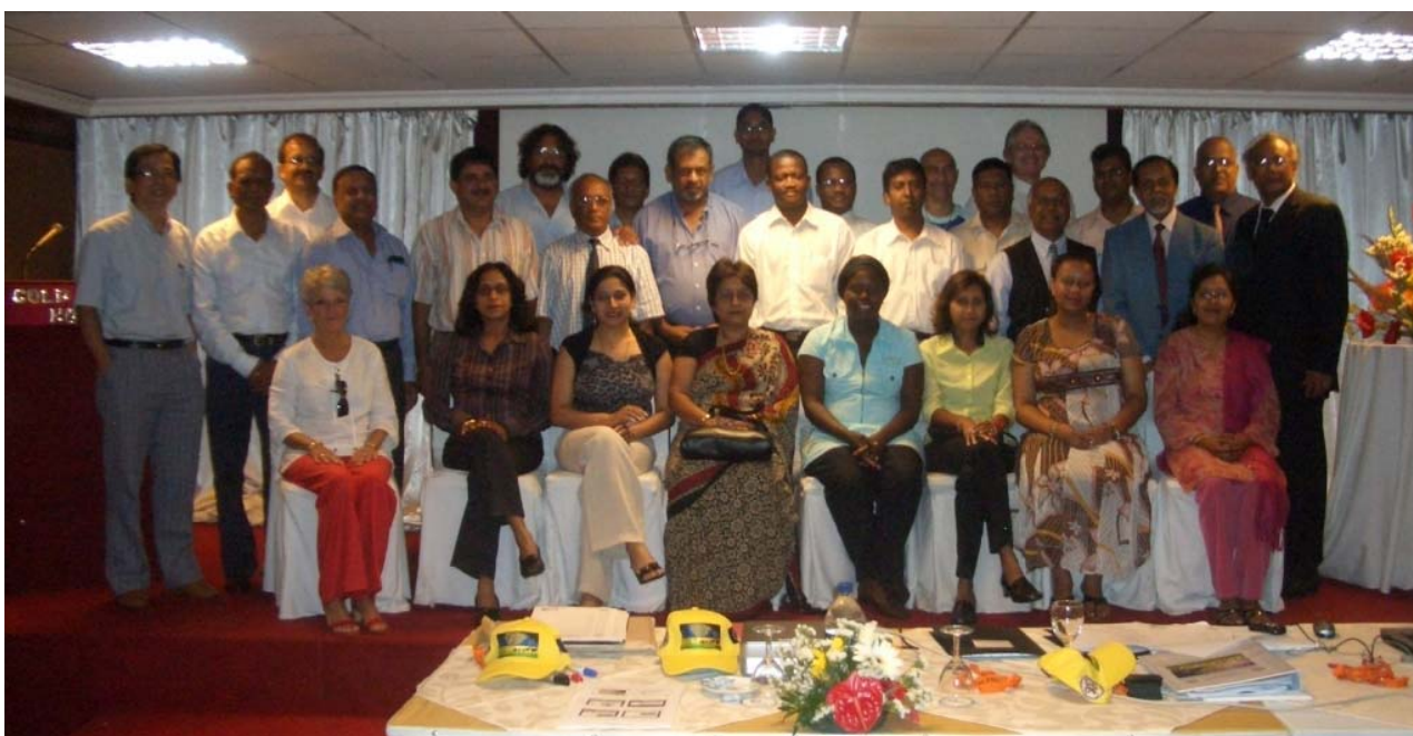
Figure 1: Participants LIMS Stakeholders Meeting at Gold Crest Hotel on 14 November 2008

The last part of the Stakeholders Meeting was devoted to the identification of data sources and mapping of the network of livestock information. Using a flip chart, data sources of each LIMS module was identified first, followed by the coordinating Department or Institution (see table 2). It was agreed that these Departments or Institutions come up shortly with names of people assigned to coordinate data collection for the specific LIMS modules. Dr. Jaumally was requested to be the overall LIMS Coordinator.