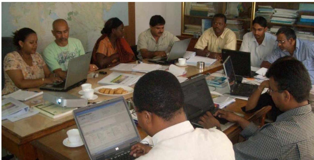
Figure 2, LIMS template and application training in Mauritius in progress

The LIMS training had two major components. These are the training on the LIMS template and the training on the operation and use of the LIMS application.