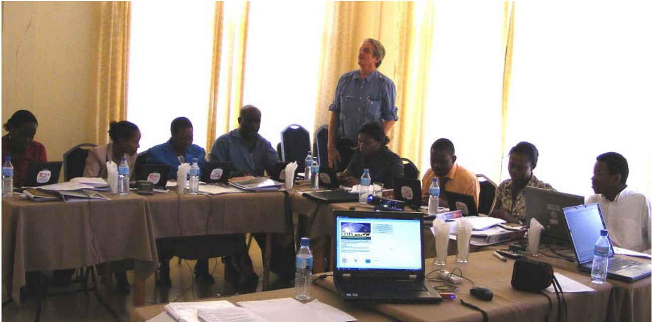
Figure 3, LIMS template and application training in Tanzania in progress

The LIMS training had two major components. These are the training on the LIMS template and the training on the operation and use of the LIMS application.