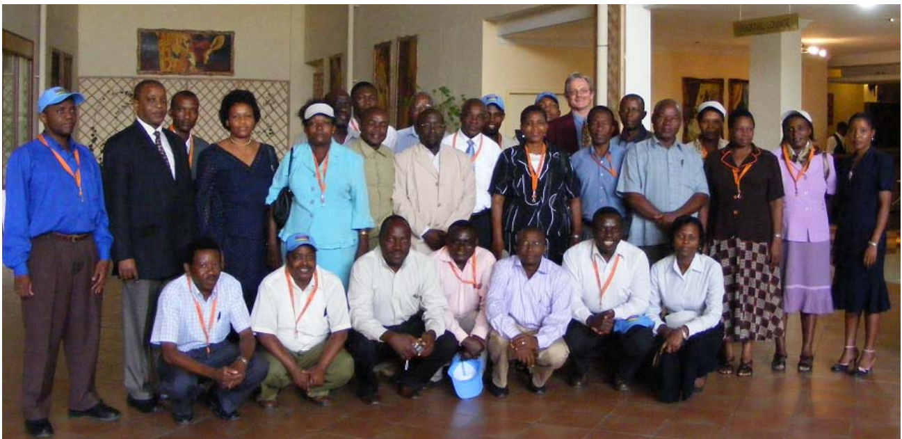
Figure 1, Participants of the LIMS stakeholders meeting at Blue Pearl Hotel on 17 October 2008