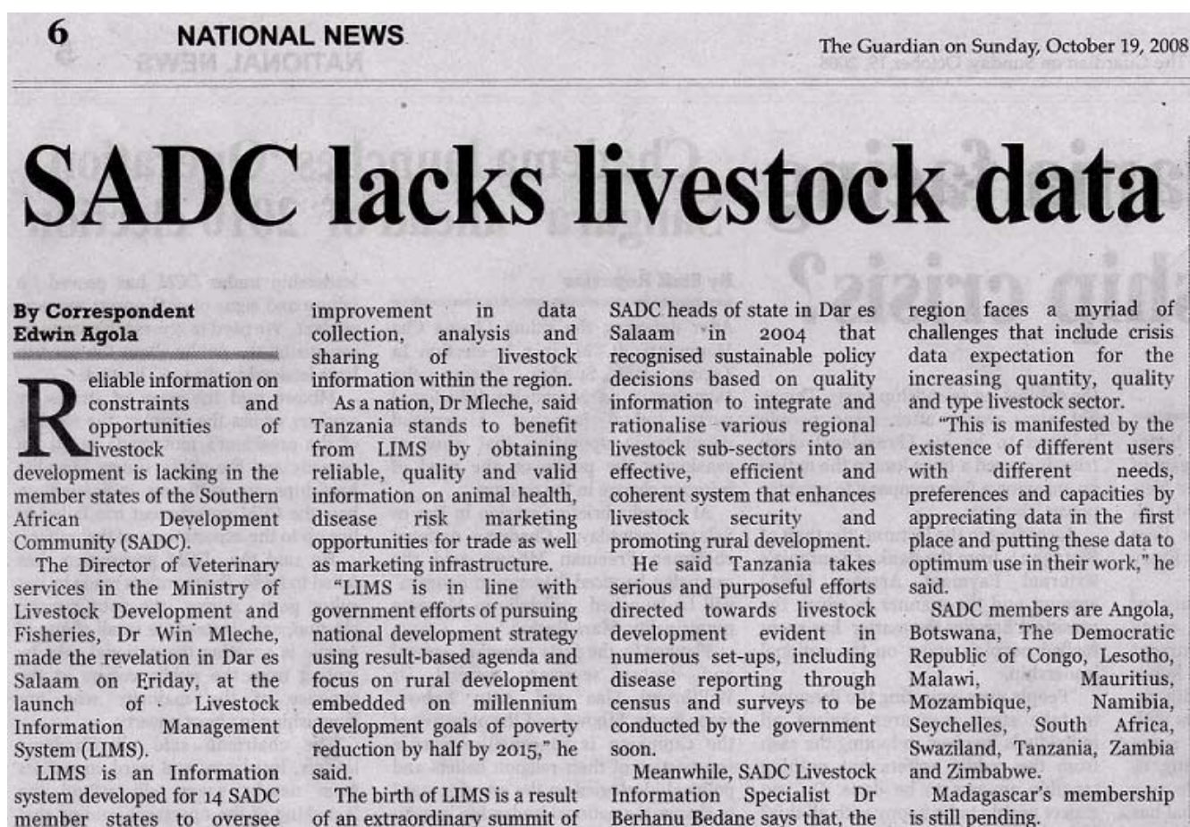
Figure 2, The newspaper article on LIMS launching in Tanzania